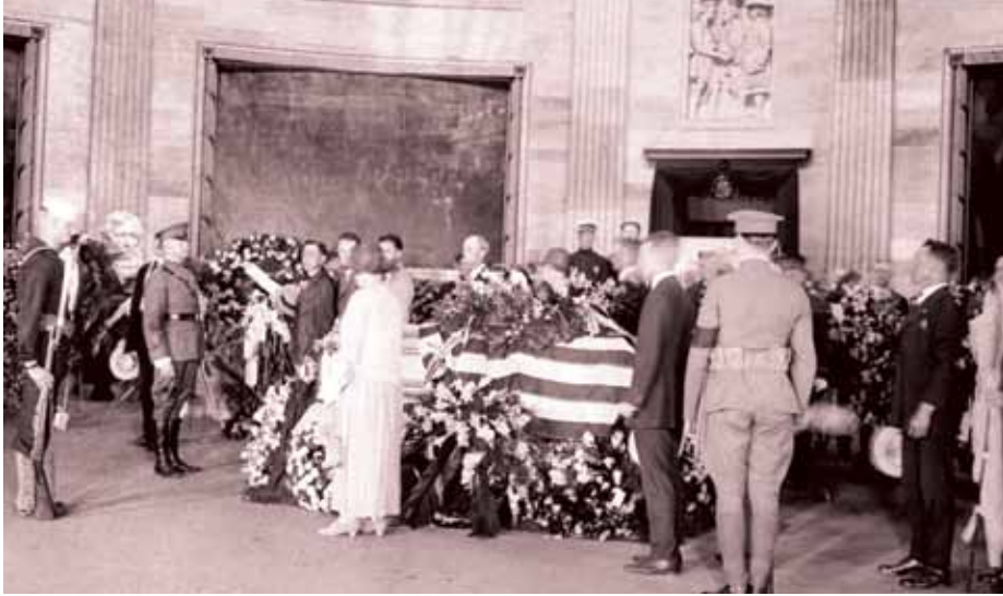
So soon forgotten: The nation grieved when Harding died. But soon the Teapot Dome Scandal erupted, which would mark the beginning of the rapid decline of his historical reputation.

first, to prosper America first, to think of America first, to exalt America first, to live for and revere America first.”