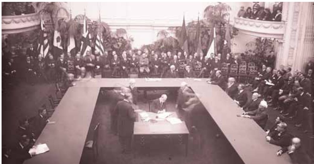
Saving money: President Harding came to office determined to slash federal spending, including spending on the military. But he also wanted to make sure that these cuts did not damage the nation’s defensive capabilities. To accomplish these twin goals, he persuaded other great powers, seen here at the Washington Naval Conference in 1922, to also lower their spending on their navies.

“The recorded progress of our Republic, materially and spiritually, in itself proves the wisdom of the inherited policy of non-involvement in Old World affairs,” Harding said, rejecting the interventionist attitudes of the progressive presidents, Democrat Wilson and fellow progressive Republican Theodore Roosevelt. “We seek no part in directing the destinies of the Old World. We do not mean to be entangled,” Harding said, aligning himself with the non-interventionist viewpoint of the Founding Fathers, such as George Washington and Thomas Jefferson. In fact, it was Harding who coined the term, “the Founding Fathers.”